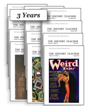
3-Year Membership with THT Subscription