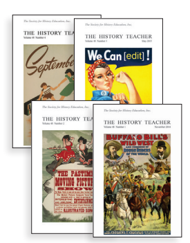
Annual Membership with THT Subscription