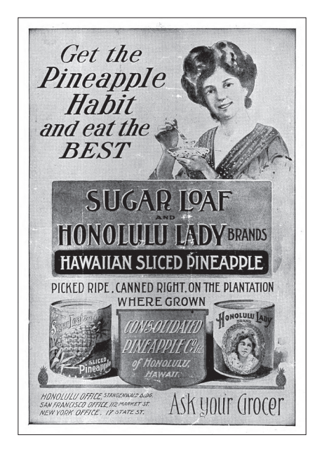
Figure 9 : Pineapple advertisement from the materials for the Alaska-Yukon-Pacific Exposition of 1909, held in Seattle, ca. 1909.

• Students are also asked to complete the rest of the table before the following class by researching the histories of the foods listed. Column C is "Where humans first ate this food." Students should fill in this column with information they find in their research, being as specific as possible (e.g., "the Andes" rather than "the Americas"). Column D is "Where humans were eating this food by 1491." Students should fill in this column with information about where each food had spread by 1491. Column E is "If I were in [location] in 1491, could I have eaten this food?" For this column, students may use whatever location they like—for example, where they currently live, where they were born, a place that they find especially interesting—and then, using information in the other columns, determine whether a person in that location could have eaten each food in 1491.