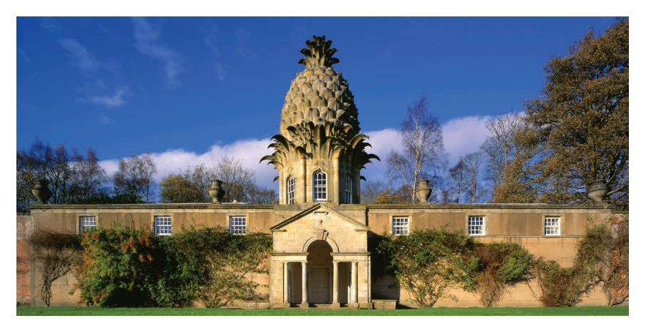
Figure 8 : The Pineapple, near Falkirk, Scotland. The structure "was built in 1761 by the Earl of Dunmore as a summerhouse where he could appreciate the views from his estate. At this time, pineapples were among Scotland's most exotic foods."