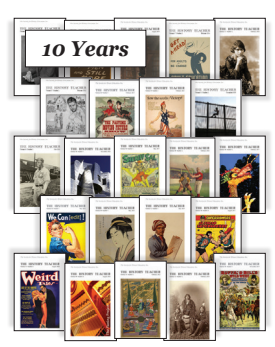
10-Year Membership with THT Subscription