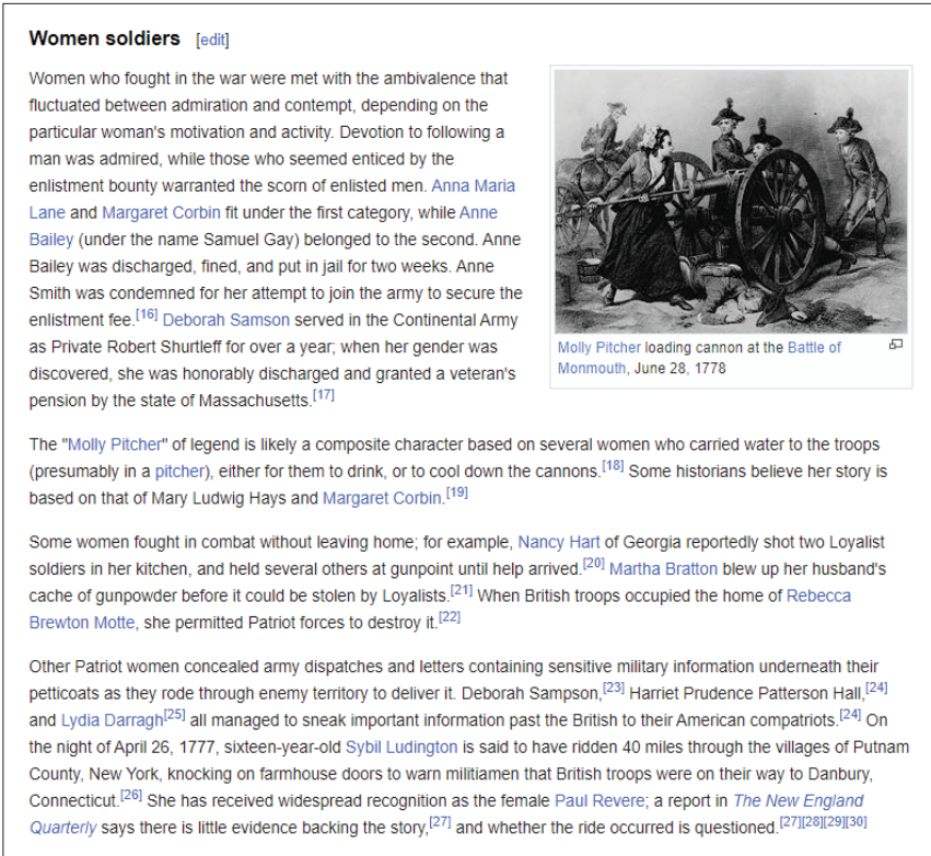
Figure 5: “Women Soldiers” section in the current “Women in the American Revolution” Wikipedia entry (at time of publication). Wikipedia, “Women in the American Revolution,” < https://en.wikipedia.org/wiki/Women_in_the_American_Revolution >.

NG” immediately restored the student’s version. 21 The “Women Soldiers” section remains to this day, now including expanded information and a historical image (see Figure 5 ). 22 Bots remove obvious vandalism among other tasks, and a community of human users, the Bot Approvals Group (BAG), “supervises and approves all bot-related activity from a technical and quality-control perspective on behalf of the English Wikipedia community.” 23 Here, we should mention that students enjoy discussing the relationship between human beings and bots (to be sure, it is a topic informed by film and television) and, more specifically, the implications of artificial intelligence (AI) for humanities research.