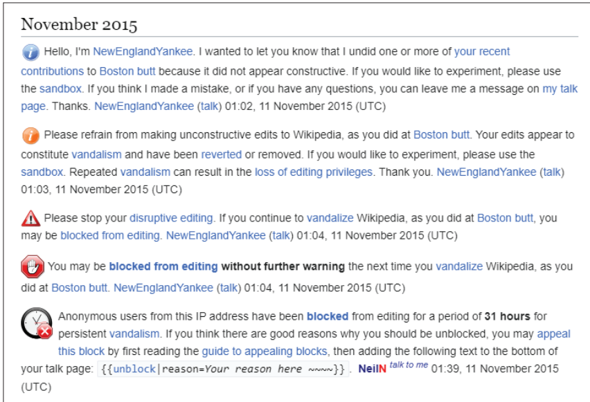
Figure 2: Editors can issue warnings to vandals, as exemplified in this screenshot of the User talk page for user 79.XX.YY.ZZ. Wikipedia, “User talk: [79.XX.YY.ZZ],” < https://en.wikipedia.org/w/index.php?title=User_talk:79.XX.YY.ZZ&oldid=690063552 >. Note that the user’s full IP address has been obscured in consideration of privacy.

Meanwhile, a different editor had just responded in “User talk” to user 79.XX.YY.ZZ regarding vandalism to a different entry, with a warning that continued vandalism could result in editorial blocking (see Figure 2 ). 15 The notice was a “stock” warning that Wikipedia employs in a five-step process that leads to a block, with the first warning assuming a “good faith” effort gone wrong. 16