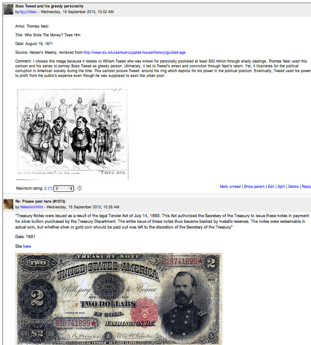
Figure 2: Sample student responses to a portion of the weekly writing assignments on the discussion board.

corrected in the first week or two, either by me or a colleague. Then there are technology problems. Students are required to embed visual media inside their posts, not just link to them. This is necessary so that all the