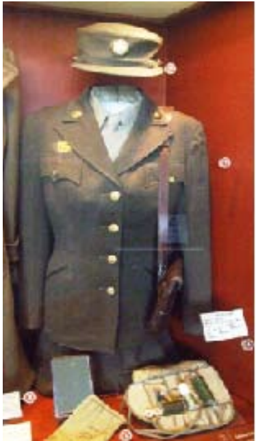
The uniforms shown above are displayed at Fort Des Moines Museum. These uniforms led newspaper reporters to call the WAACs "skirted soldiers."