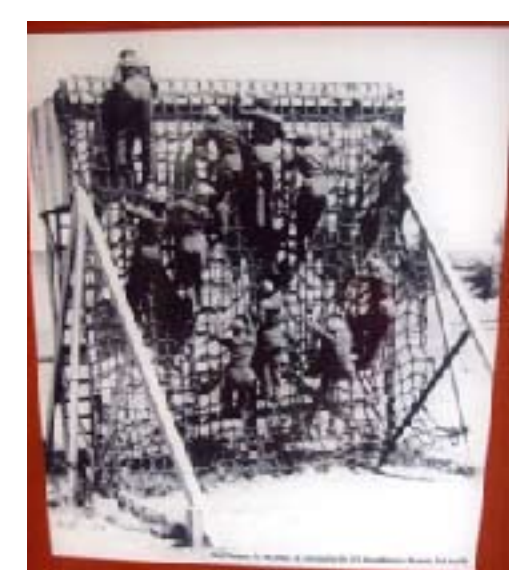
Fort Des Moines, Iowa was the first training center for WAACs. I took the above pictures at the museum at Fort Des Moines. On the left is a poster used after the WAACs became WACs. On the right is a picture taken of women climbing a rope wall. At Fort Des Moines the women studied military first aid and sanitation, military customs and courtesy, map reading, chemical attack defense, and physical training.