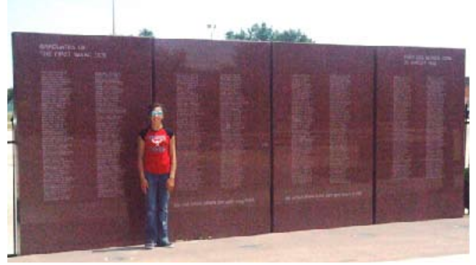
In this picture taken at Fort Des Moines Museum, I am standing in front of a wall honoring the graduates of the first WAAC Officer Candidate School. A quote fitting WAAC philosophy is engraved at the bottom of the wall: "Do not follow where the path may lead. Go where there is no path and leave a trail."